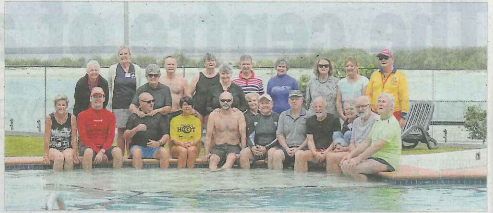
SURF SAFETY: Seniors take the Grey Medallion course during Seniors Week.